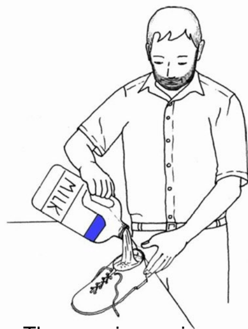
The man is pouring milk into a shoe