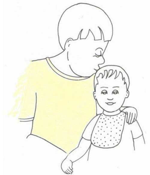
The boy is kissing a baby