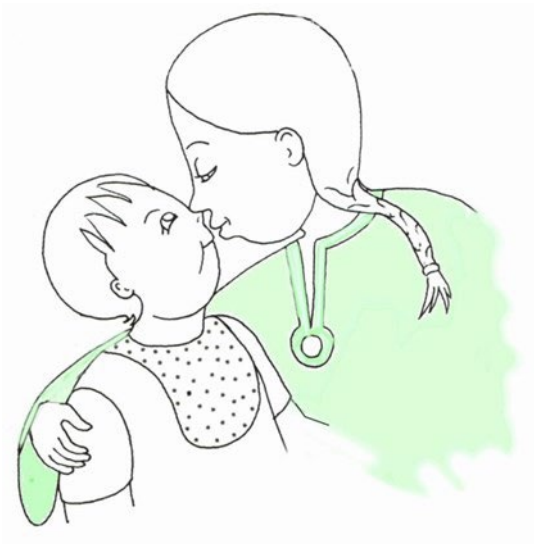
The girl is kissing a baby