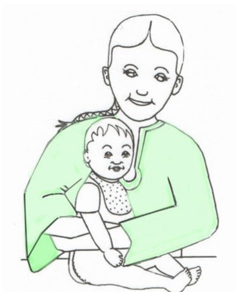
The girl is hugging a baby