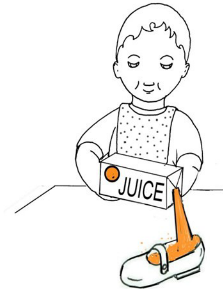
The baby is pouring juice into a shoe