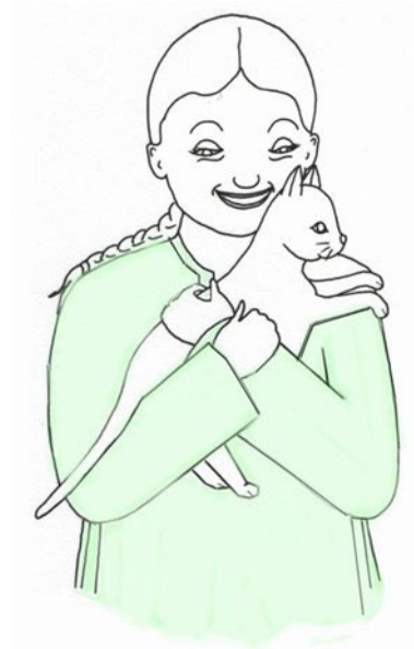
The girl is hugging a cat