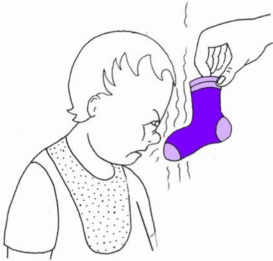
The baby is smelling a sock