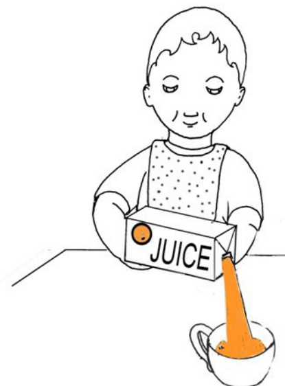
The baby is pouring juice into a cup