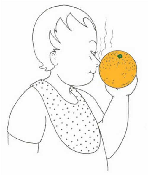
The baby is smelling an orange