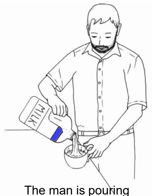
The man is pouring milk into a cup