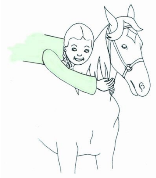
The girl is hugging a horse